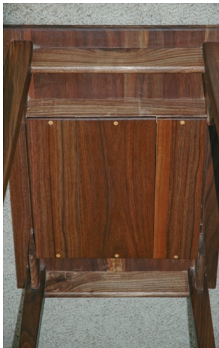
Frame bottom installed

The last construction task is to mill the boards (K) that fit under the drawers and form an integral part of the table. These are made and installed last so you can ensure that the drawers fit well and slide in easily. Use 5/16" dowels (L) to attach the boards to the bottom of the drawer frame; a narrow