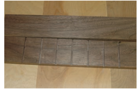
Drawer front/back dadoed

board. To prevent the inevitable splintering that can occur with such thin pieces of wood use a backer board. Sandwich the dividers between two scraps of plywood, draw an alignment mark on the top of the