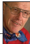
JERRY HAIGH www.jerryhaigh.com

Whether you're an avid chess player or just like the occasional game of checkers, this chess table will make a fine addition to living room or den.