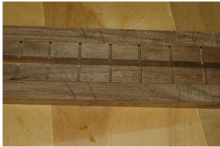
Drawer front/back cut and reassembled

The dividers (O, P) are somewhat fiddly.