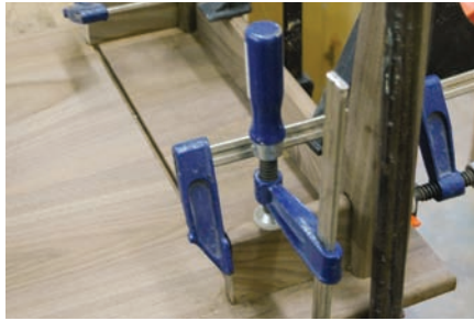
Clamping apron to top

You need to cut matching \frac{1}{8} " x \frac{3}{8} " dados on the long dividers (O) that line up with the dados on the back and front pieces (N). The short dividers (P) are easier to do, as they only need a single dado cut in the middle of the