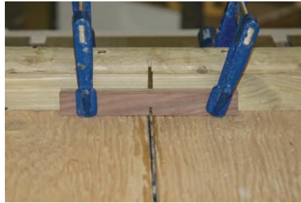
Short divider ready to cut

board. To prevent the inevitable splintering that can occur with such thin pieces of wood use a backer board. Sandwich the dividers between two scraps of plywood, draw an alignment mark on the top of the